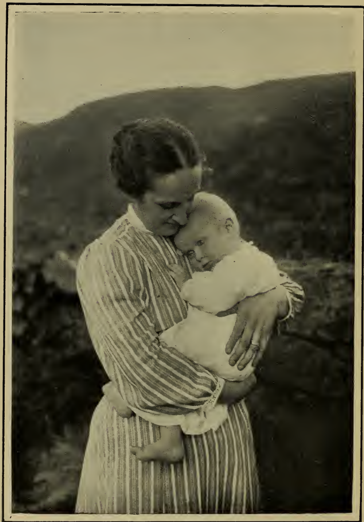
THE AGE OF DEPENDENCE